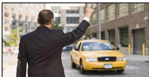
hailing a taxi