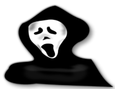
(comedy - horror)