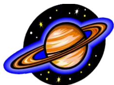
(Planet - meteorite)