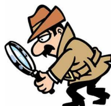
( cop - detective )