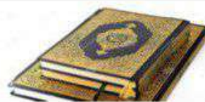
The holy Qur'an